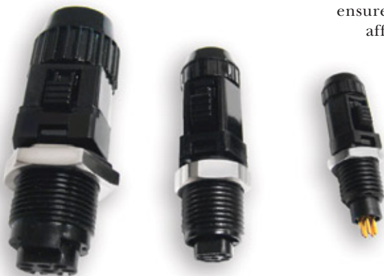
New materials were applied across the D series platform without impacting contact density, the ability to intermate with existing D series designs, or the integration of existing contact technologies.

tion utilized hyperboloid contacts, providing compliance with device electrical requirements (high cycle life for the system side receptacle/low contact resistance) and the durability and reliability to survive the harsh chemicals and temperatures associated with the required sterilization processes. The system-side panel mount receptacle contained the hyperboloid contacts while the cost-effective plug used male pins to