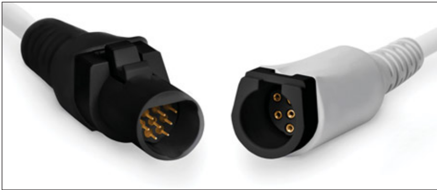
D Series connectors have a proven heritage in medical devices and applications from disposable catheters to the mating cables.