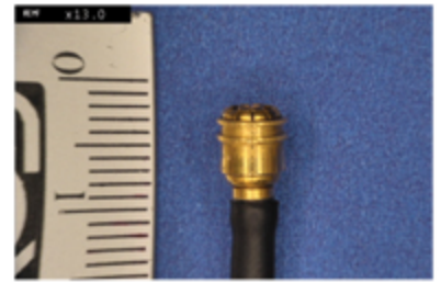
Figure 3 Mini-Lock connector with quick-lock mechanism.