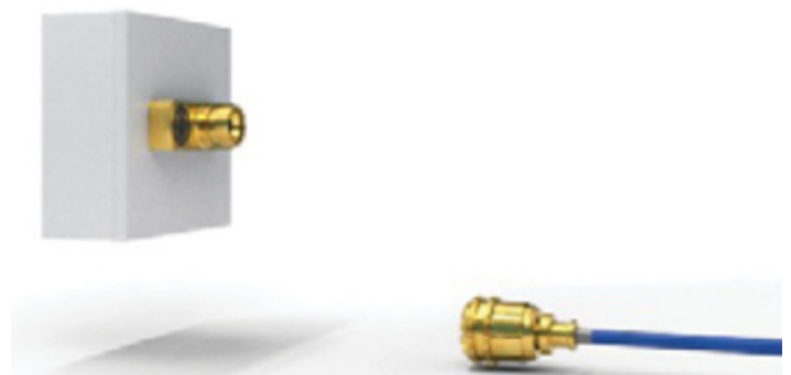
Figure 2 Mini-Lock mating connectors.