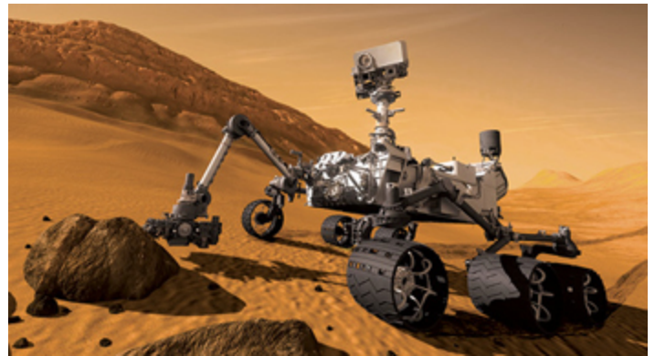
Figure 4 Mars Rover.